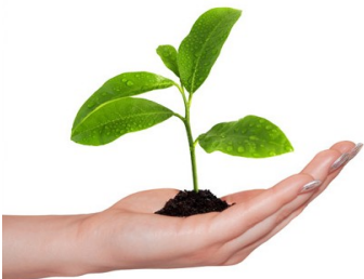
Empowering Customers, Supporting Business

Whether it is commercial contracts supporting Joint Ventures, Build-Operate-Own arrangements, Affiliations, Marketing Partnerships or Alliances, Zeta Intelex's contracts team has drafted, reviewed or marked them all. Our main learning from commercial contracts is that the remote provider should always exhaustively collect details from the customer before sending out the