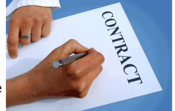
Balance, Consensus & Converging Interests

The definitions inserted by our team, and the overall texture of the documents, not only won high praise from the customer, but could patently be seen to solve a number of problems affecting other documents in the chain.