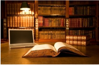
The Best Of Both Worlds At Zeta Intelex Legal Research

The legal research team at Zeta Intelex recently turned around an interesting comparative legal research project on gaming laws in the US.